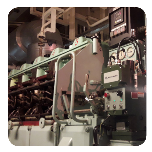
Hyundai Himsen H21/32