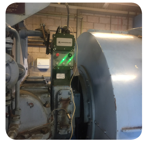
Mirrlees Blackstone 80G