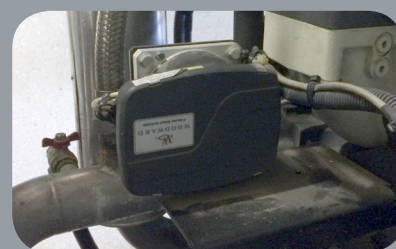
F-Series Throttle Valve Positioner