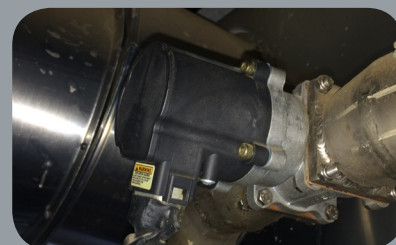
L-Series Trim Valve Positioner