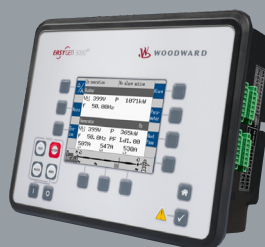
EASYGEN 3500XT Genset Control