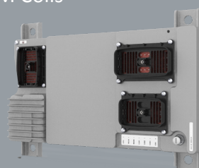
E6 Lean Burn Trim System